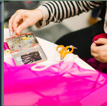
Person Pinning Pink Chiffon.

Summer is right around the corner, and its time to make plans! We are really excited about all of our Summer Fun Programs! Each program is designed to incorporate learning and skill mastery into exciting hands on projects.