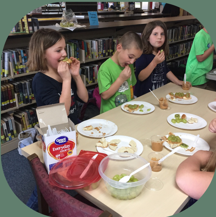
Kids eating Snack Sea Turtles Bagels, Grapes, Kiwi, and Peanut Butter