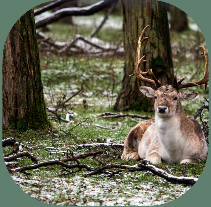
A picture of a deer in the forest.

Twice a month at Pamlico County Middle School 4-Hers get in touch with their wild side. They've learned all about the eco-regions of North Carolina; native populations of Flora and Fauna; and how to best protect them.