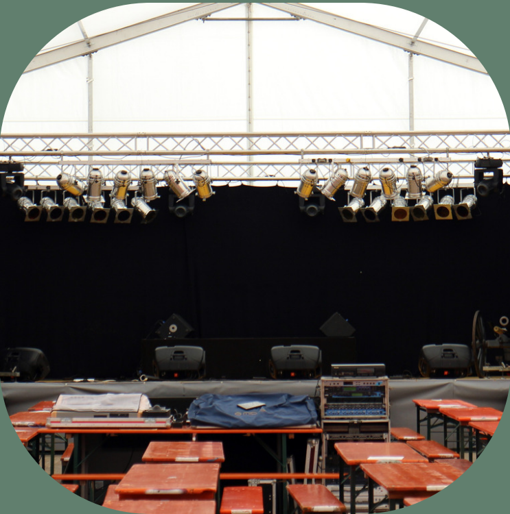
A picture of an auditorium.

Since October Middle Schoolers at Pamlico County Middle School have been honing their skills. District and State Presentation Competitions are coming up, so members are writing speeches, preparing demonstrations, and putting together slides.