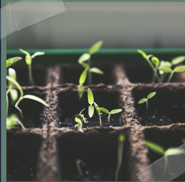
Herbs Ready to be planted

When: June 21st, 28th, & July 5th Ages: 11- 14 Time: 1 - 5 pm Cost: $20 Register by June 15th