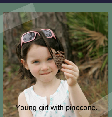
Young girl with pinecone.

Adventure Club: Love the Outdoors? We do too! Join us for three days of hiking and exploration in NC's great parks!