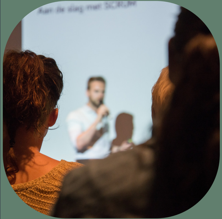
A man giving a speech with a power point.