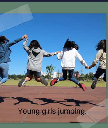
Young girls jumping.

When: July 26th & August 2nd, 9th Time: 1- 5pm Cost: $15 Max: 10 Age: 7-9 Register By: July 13th